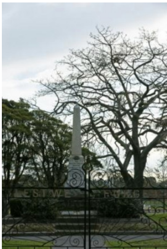
Glen Waverley WWI Memorial.jpg