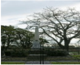
Glen Waverley WWI Memorial.jpg