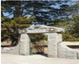
Mentone Memorial Gates.jpg