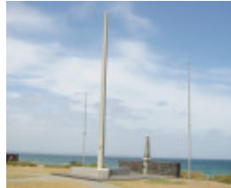
City of Kingston Heritage Study