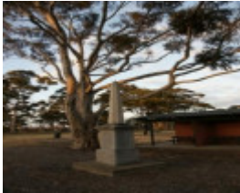
Campbellfield War Memorial.jpg