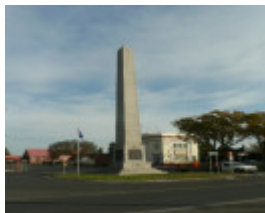
Princes Hwy Terang war memorial