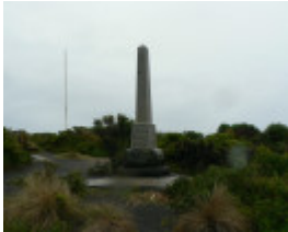
Lord Street Port Campbell War Memorial