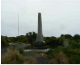
Lord Street Port Campbell War Memorial