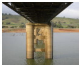
h00989 bethanga bridge bellbridge pylons 02 jun20044 mz