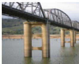
h00989 bethanga bridge bellbridge pylons 01 jun20044 mz