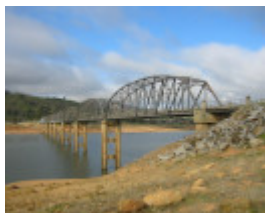
h00989 bethanga bridge bellbridge north nsw side jun20044 mz