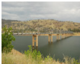
BETHANGA BRIDGE SOHE 2008