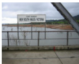
h00989 bethanga bridge bellbridge border jun20044 mz