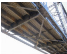
h00989 bethanga bridge bellbridge deck structure jun20044 mz