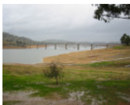
h00989 bethanga bridge south from vic 02 jun20044 mz