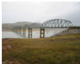
h00989 01 bethanga bridge south from vic 01 jun20044 mz