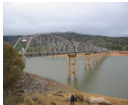
h00989 bethanga bridge bellbridge south side from nsw jun20044 mz