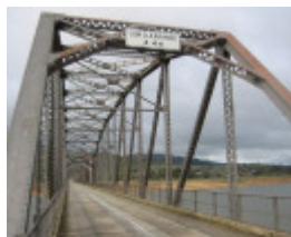
h00989 bethanga bridge bellbridge pratt truss north nsw 02 jun20044 mz