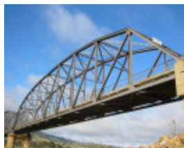
h00989 bethanga bridge bellbridge pratt truss north nsw 01 jun20044 mz