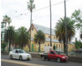
ST KILIANS CATHOLIC CHURCH SOHE 2008