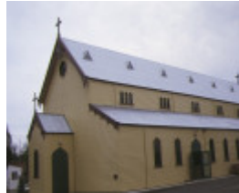
1 st kilians church bendigo side view dec1998