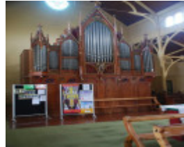
ST KILIANS CATHOLIC CHURCH SOHE 2008