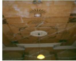
h01697 rothbury drawing