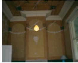
h01697 rothbury yendon drawing room