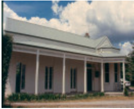
h01697 1 rothbury yendon