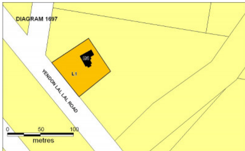
h01697 rothbury yendon plan