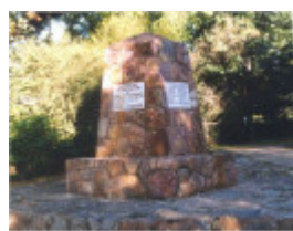
Eldorado War Memorial