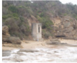
Fortifications, Point Lonsdale Road, Queenscliff