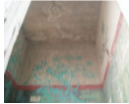
Fortifications, Point Lonsdale Road, Queenscliff