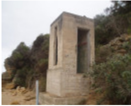
Fortifications, Point Lonsdale Road, Queenscliff