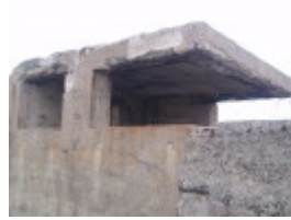
Fortifications, Point Lonsdale Road, Queenscliff