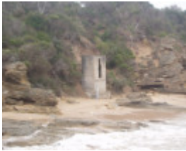
Fortifications, Point Lonsdale Road, Queenscliff