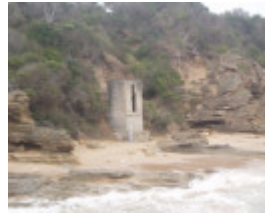
Fortifications, Point Lonsdale Road, Queenscliff