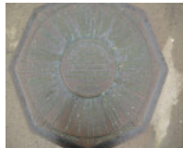
Fortifications, Point Lonsdale Road, Queenscliff