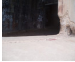
Fortifications, Point Lonsdale Road, Queenscliff