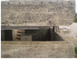
Fortifications, Point Lonsdale Road, Queenscliff