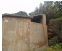
Fortifications, Point Lonsdale Road, Queenscliff