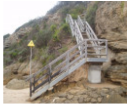
Fortifications, Point Lonsdale Road, Queenscliff