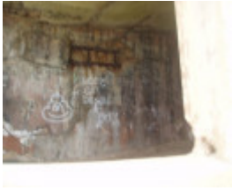
Fortifications, Point Lonsdale Road, Queenscliff