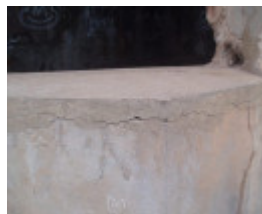
Fortifications, Point Lonsdale Road, Queenscliff