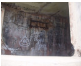
Fortifications, Point Lonsdale Road, Queenscliff