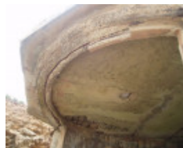
Fortifications, Point Lonsdale Road, Queenscliff