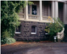
h02037 shrublands canterbury cellar