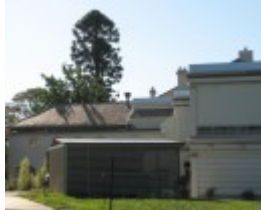
SHRUBLANDS SOHE 2008