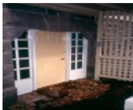
h02037 shrublands canterbury cellar door