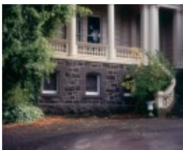
h02037 shrublands canterbury cellar