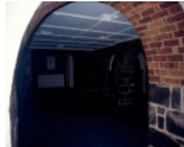
h02037 shrublands canterbury cellar interior