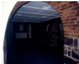
h02037 shrublands canterbury cellar interior