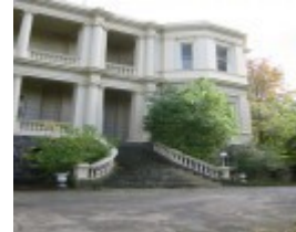
h02037 shrublands canterbury entry