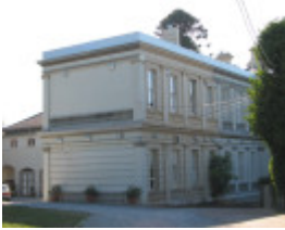
SHRUBLANDS SOHE 2008