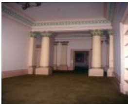
h02037 shrublands canterbury entry hall