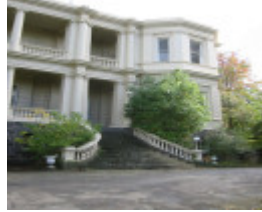
h02037 shrublands canterbury entry