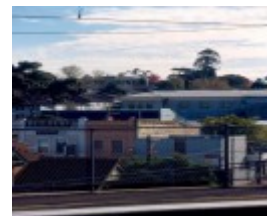
h02037 shrublands canterbury distance