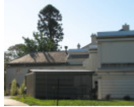
SHRUBLANDS SOHE 2008