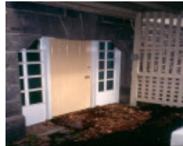
h02037 shrublands canterbury cellar door