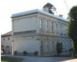
SHRUBLANDS SOHE 2008