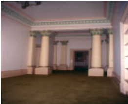
h02037 shrublands canterbury entry hall