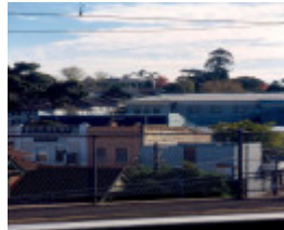
h02037 shrublands canterbury distance