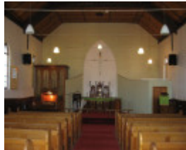
Hill pipe organ_in situ_KJ_29 may 08