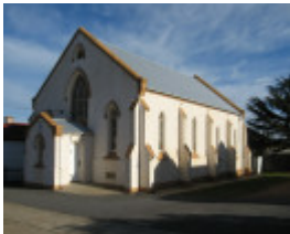
St Peters Lutheran church_Stawell_KJ_29 may 08