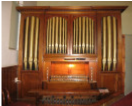
Hill pipe organ-St Peters Stawell_KJ_29 may 08