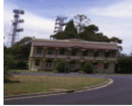
1 goldmines hotel bendigo front view dec1998