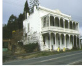
goldmines hotel bendigo north west view jul1990