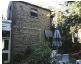
goldmines hotel bendigo apr1990