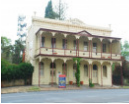
GOLDMINES HOTEL SOHE 2008