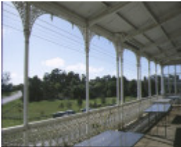
goldmines hotel bendigo balcony