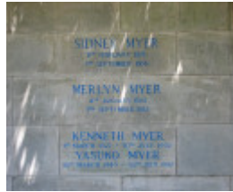
BOX HILL CEMETERY COLUMBARIUM AND MYER MEMORIAL SOHE 2008