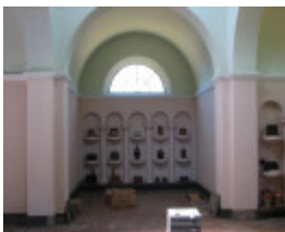
BOX HILL CEMETERY COLUMBARIUM AND MYER MEMORIAL SOHE 2008