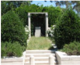
BOX HILL CEMETERY COLUMBARIUM AND MYER MEMORIAL SOHE 2008