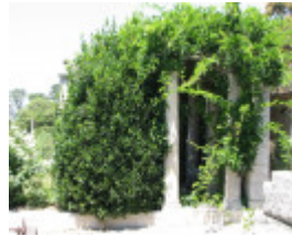
BOX HILL CEMETERY COLUMBARIUM AND MYER MEMORIAL SOHE 2008