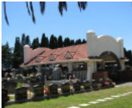
BOX HILL CEMETERY COLUMBARIUM AND MYER MEMORIAL SOHE 2008