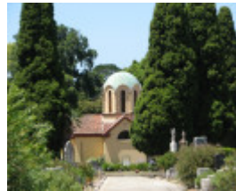
BOX HILL CEMETERY COLUMBARIUM AND MYER MEMORIAL SOHE 2008