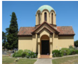
BOX HILL CEMETERY COLUMBARIUM AND MYER MEMORIAL SOHE 2008