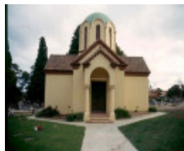
h02045 box hill cemetery columbarium