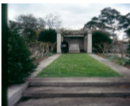
h02045 box hill cemetery myer memorial