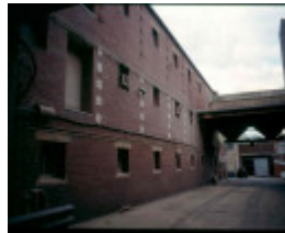
h02050 richmond maltings west elevation 1930 malthouse mz june03