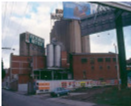
h02050 richmond maltings view from punt rd ro june03