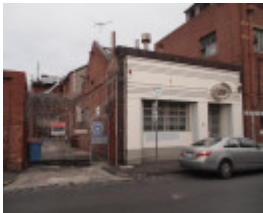
H2050 RICHMOND MALTING LHA 2015 5.JPG