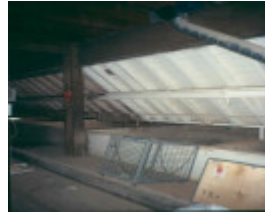
h02050 richmond maltings steps and grain hoppers 1930 malthouse mz june03