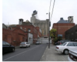
RICHMOND MALTINGS SOHE 2008