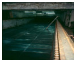
h02050 richmond maltings saladin box 1880 malthouse mz june03