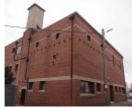
H2050 RICHMOND MALTING LHA 2015 4.JPG