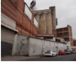
H2050 RICHMOND MALTING LHA 2015 2.JPG