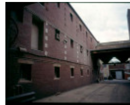
h02050 richmond maltings west elevation 1930 malthouse mz june03