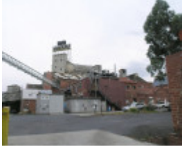
RICHMOND MALTINGS SOHE 2008