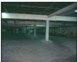
h02050 richmond maltings ground floor 1920 malthouse mz june03