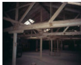
h02050 richmond maltings first floor 1920 malthouse mz june03