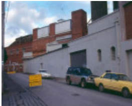
h02050 richmond maltings view east along gough st ro june03