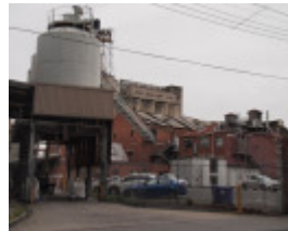
H2050 RICHMOND MALTING LHA 2015 6.JPG