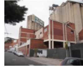
H2050 RICHMOND MALTING LHA 2015 1.JPG