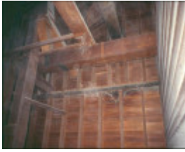
h02050 richmond maltings storage rooms and machinery mz june03