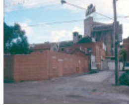
h02050 1 richmond maltings view along gough st ro jun03