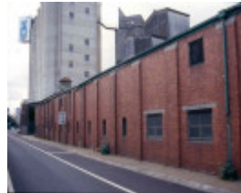
h02050 richmond maltings view from harcourt pde ro june03