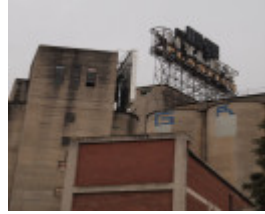
H2050 RICHMOND MALTING LHA 2015 3.JPG