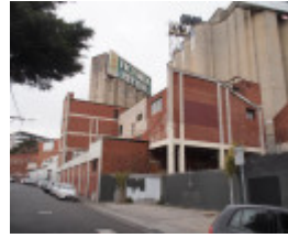
H2050 RICHMOND MALTING LHA 2015 1.JPG