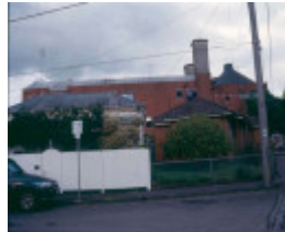
h02050 richmond maltings view from melrose st ro june03