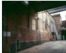
h02050 richmond maltings east elevation 1880 malthouse mz june03