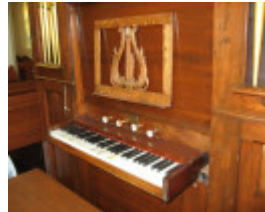
Moyle organ St Linus Merlynston_front detail_11 Feb 08 2