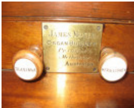
Moyle organ St Linus Merlynston_nameplate_11 Feb 08 5