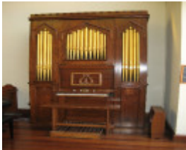
Moyle organ St Linus Merlynston_front_11 Feb 08