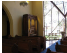
Moyle organ St Linus Merlynston_site in church_11 Feb 08 10