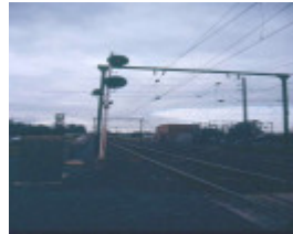
h02025 7 bunyip sub stationjul03 jc