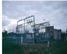
h02025 4 bunyip sub stationjul03 jc1