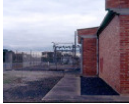
h02025 2 bunyip sub stationjul03 jc