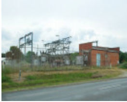
BUNYIP RAILWAY SUB STATION SOHE 2008