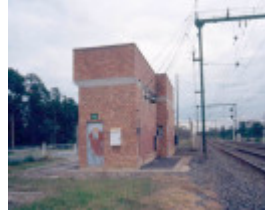
h02025 1 bunyip sub stationjul03 jc