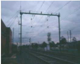
h02025 6 bunyip sub stationjul03 jc