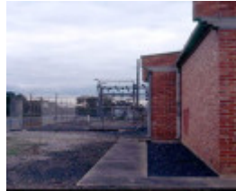
h02025 2 bunyip sub stationjul03 jc