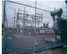
h02025 5 bunyip sub stationjul03 jc