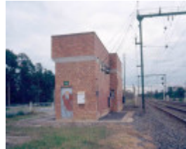
h02025 1 bunyip sub stationjul03 jc