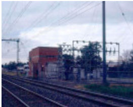
h02025 3 bunyip sub stationjul03 jc