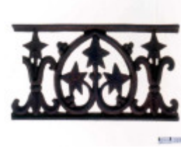
h01889 gisborne mains artefacts lace