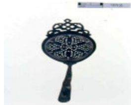
h01889 gisborne mains artefacts strainer spoon