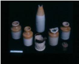
h01889 gisborne mains artefacts pottery