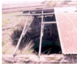
h01889 gisborne mains house cistern