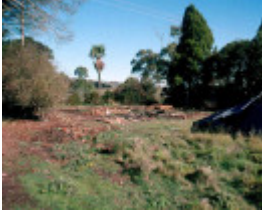
h01889 1 gisborne mains site