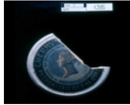
h01889 gisborne mains artefacts cosmetic lid