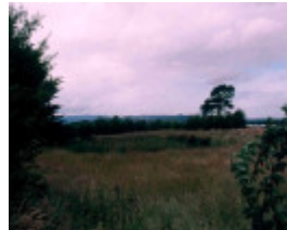
h01889 gisborne mains site2