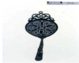
h01889 gisborne mains artefacts strainer spoon