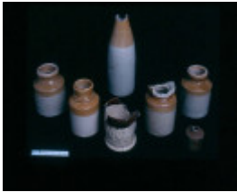
h01889 gisborne mains artefacts pottery