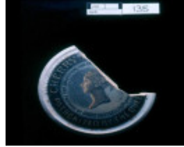
h01889 gisborne mains artefacts cosmetic lid