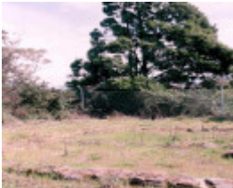
h01889 gisborne mains house site