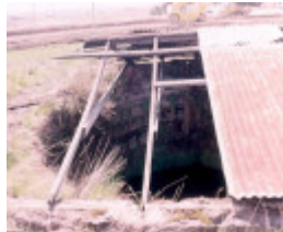
h01889 gisborne mains house cistern