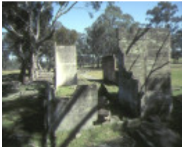
h02048 camp 1 dhurringile skittle alley 2 oct1999