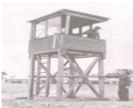
h02048 camp 1 dhurringile tower