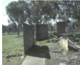
h02048 camp 1 dhurringile skittle alley 1 oct1999