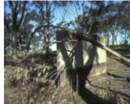
h02048 camp 1 dhurringile rebound wall oct1999