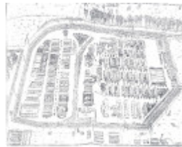
h02048 camp 1 dhurringile site plan