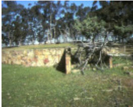
h02048 1 camp 1 dhurringile cafe wellbleeh oct1999