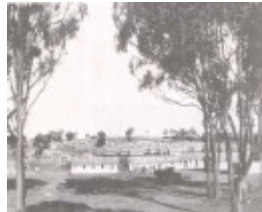
h02048 camp 1 dhurringile site photo