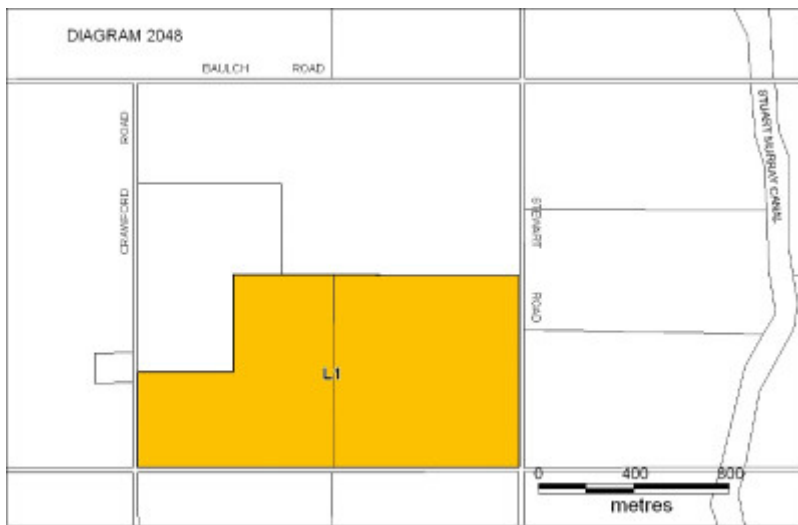
h02048 revised diagram 2048