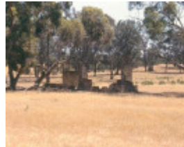
h02048 camp 1 dhurringile ruin oct1999