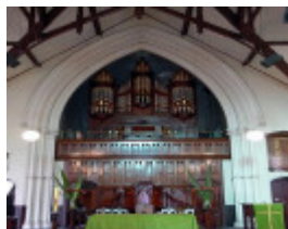
Fincham & Hobday organ_South Melbourne Southport Uniting_KJ_Sept 08