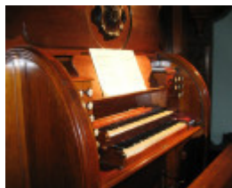
Fincham & Hobday organ_South Melbourne Southport Uniting_KJ_Sept 08