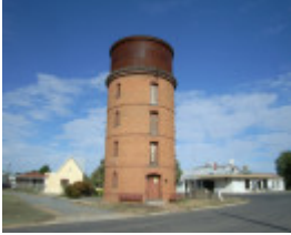
FORMER RAILWAY WATER TOWER SOHE 2008