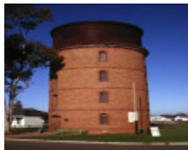
1 former railway water tower comyn avenue murtoa front view