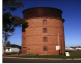
1 former railway water tower comyn avenue murtoa front view