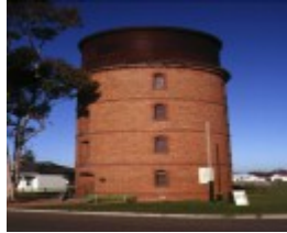
1 former railway water tower comyn avenue murtoa front view