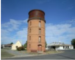
FORMER RAILWAY WATER TOWER SOHE 2008