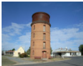
FORMER RAILWAY WATER TOWER SOHE 2008