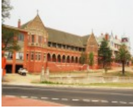
ST AIDAN'S ORPHANAGE SOHE 2008