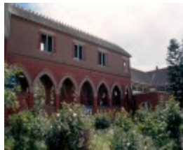
h02057 st aidans orphanage bendigo link