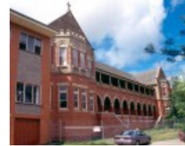
h02057 st aidans orphanage bendigo 1931