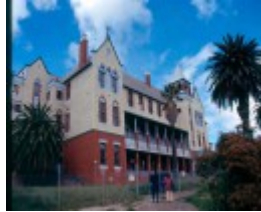
h02057 1 st aidans orphanage bendigo