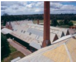
h02057 st aidans orphanage bendigo laundry