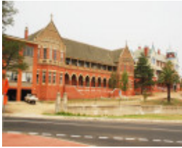
ST AIDAN'S ORPHANAGE SOHE 2008