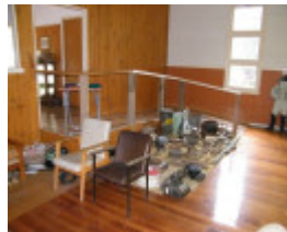
relocation of the sectional steam cyl. from the All Nations gold mine to the Woods Point museum.