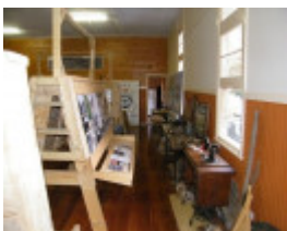
relocation of the sectional steam cyl. from the All Nations gold mine to the Woods Point museum.