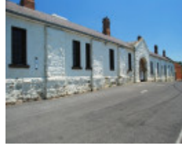
Relocation of the sectional steam cyl. from the All Nations gold mine to the Woods Point museum.