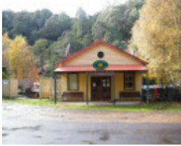
Relocation of the sectional steam cyl. from the All Nations gold mine to the Woods Point museum.