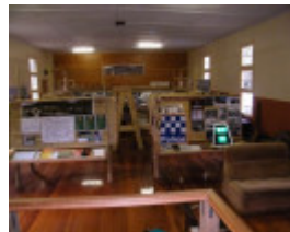
relocation of the sectional steam cyl. from the All Nations gold mine to the Woods Point museum.