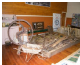
relocation of the sectional steam cyl. from the All Nations gold mine to the Woods Point museum.