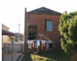
Maryborough cab building rear_KJ_8 Nov 07