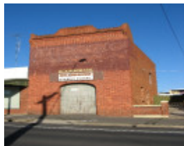
Maryborough cab building_KJ_8 Nov 07