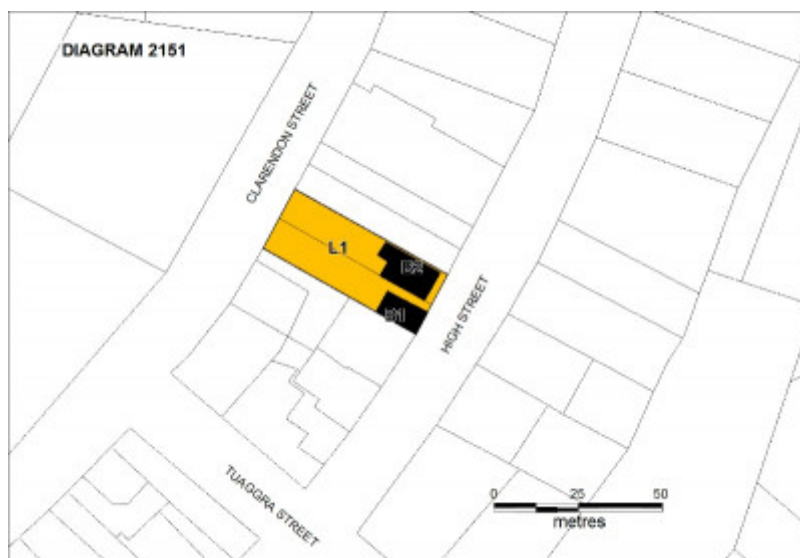
Cab building and house_Maryborough_plan