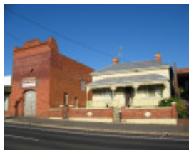
Maryborough cab building & house_KJ_8 Nov 07