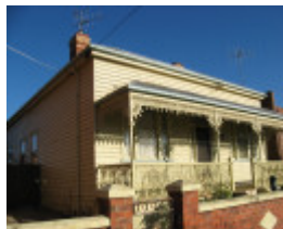
Maryborough cab building residence_KJ_8 Nov 07