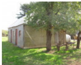
Burgers Penshurst_stable building_KJ_1 apr 09