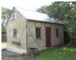
Burgers Penshurst_main cottage living room_KJ_1 apr 09