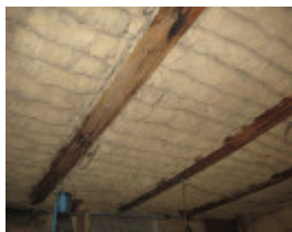
Burgers Penshurst_main cottage lehmwickel ceiling_KJ_1 apr 09