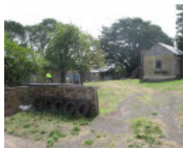
Burgers Penshurst_sitew with stable on left main cottage right_KJ _ apr 09