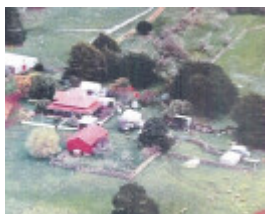
Burgers farm_stable in centre, main cottage under tree to its right