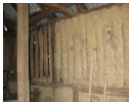
Burgers Penshurst_stable lehmwickel wall_KJ_1 apr 09