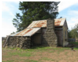
Burgers Penshurst_main cottage rear_KJ_1 apr 09