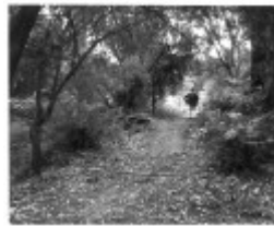
Refuge Cove, evidence of a stone base of what was originally thought to be part of try works but later identified as a house