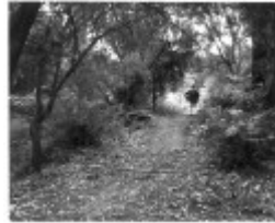
Refuge Cove, evidence of a stone base of what was originally thought to be part of try works but later identified as a house