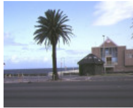
pier off kerford road albert park street view sep1992