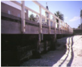
pier off kerford road albert park side detail