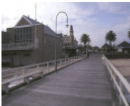
pier off kerford road albert park top view sep1992