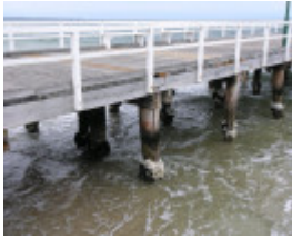
KERFERD ROAD PIER SOHE 2008