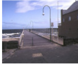
1 pier off kerford road albert park front view sep1992