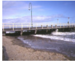
pier off kerford road albert park side view sep1992