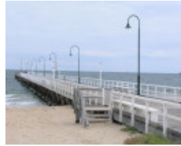
KERFERD ROAD PIER SOHE 2008