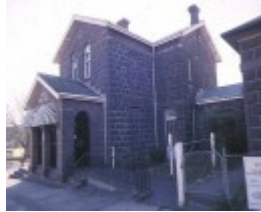
1 former kilmore post office powlett street kilmore front view