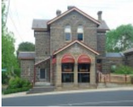
FORMER KILMORE POST OFFICE SOHE 2008