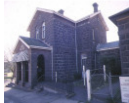
1 former kilmore post office powlett street kilmore front view