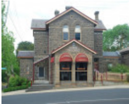
FORMER KILMORE POST OFFICE SOHE 2008