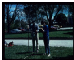
JOLIMONT SQUARE EXCAVATION