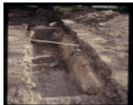
JOLIMONT SQUARE EXCAVATION