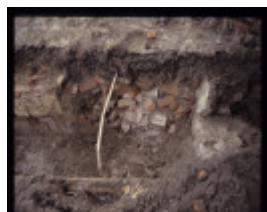
JOLIMONT SQUARE EXCAVATION