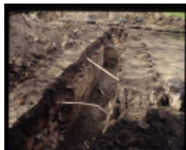
JOLIMONT SQUARE EXCAVATION