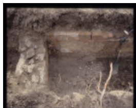
JOLIMONT SQUARE EXCAVATION