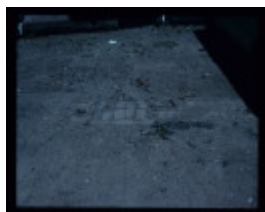
JOLIMONT SQUARE EXCAVATION