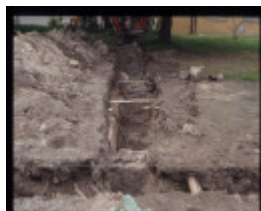
JOLIMONT SQUARE EXCAVATION