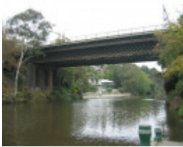
h00050 1 hawthorn bridge may 05