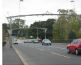
h00050 hawthorn bridge may 05 roadway