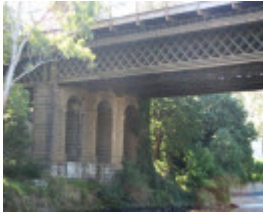
HAWTHORN BRIDGE SOHE 2008