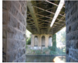
HAWTHORN BRIDGE SOHE 2008