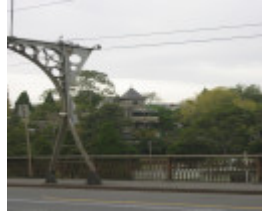
h00050 hawthorn bridge may 05 tram gantry