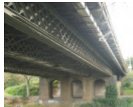
h00050 hawthorn bridge may 05 view from below