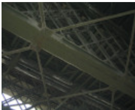
h00050 hawthorn bridge may 05 trusses