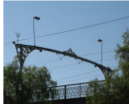
HAWTHORN BRIDGE SOHE 2008