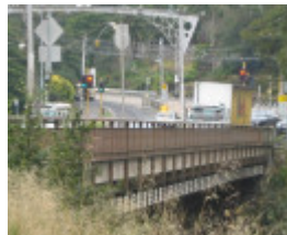
h00050 hawthorn bridge may 05 view east