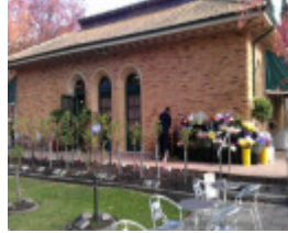
Fawkner Memorial Park