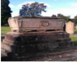
Fawkner Memorial Park