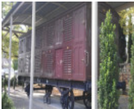
Fawkner Memorial Park