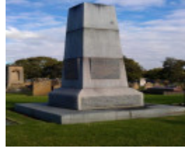
Fawkner Memorial Park