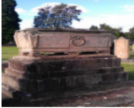
Fawkner Memorial Park