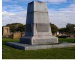
Fawkner Memorial Park