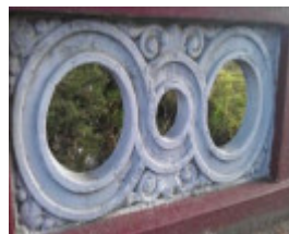
Fawkner Memorial Park