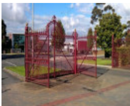
Fawkner Memorial Park