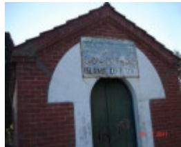
Fawkner Memorial Park