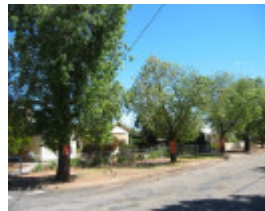
h02061 kurrajong trees comyn street sign 02 2004