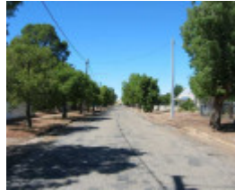
h02061 kurrajong trees comyn street 01 2004