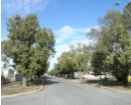
KURRAJONG AVENUE SOHE 2008