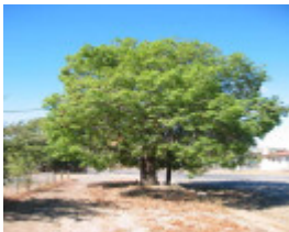
h02061 measured tree 1