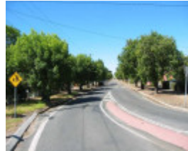
h02061 1 kurrajong trees comyn street 02 2004