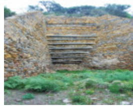
BELL POINT LIME KILN SOHE 2008