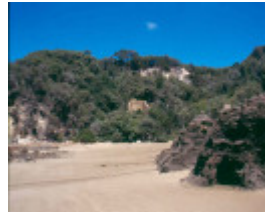
h02068 bell point kiln 2