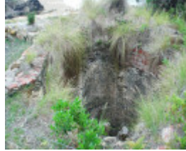
BELL POINT LIME KILN SOHE 2008