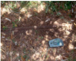
H02068 bell point rail