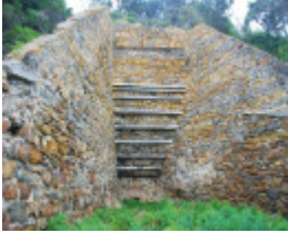
BELL POINT LIME KILN SOHE 2008