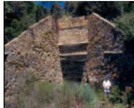
h02068 bell point kiln 3