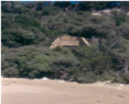
h02068 bell point kiln 1