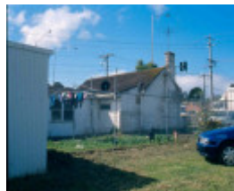
Sunnyside Wool Scour Residence