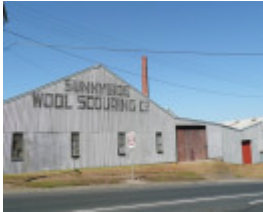
SUNNYSIDE WOOL SCOUR SOHE 2008