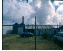
Sunnyside Wool Scour Tucker Rd View