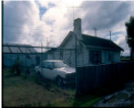
Sunnyside Wool Scour Residence