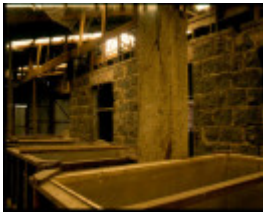
Sunnyside Wool Scour Interior