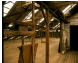
Sunnyside Wool Scour Interior