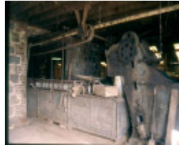
h01146 sunnyside wool scour interior 1