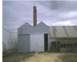
1 sunnyside wool scour tucker road breakwater front view apr1997