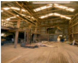
h01146 sunnyside wool scour interior 5