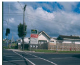
Sunnyside Wool Scour Intersection