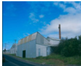
Sunnyside Wool Scour Breakwater Rd