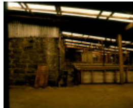
Sunnyside Wool Scour Interior