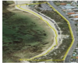
H2369 the brighton bathing boxes and dendy street beach air photo 21-11-2017.JPG