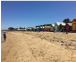
2017, looking north .jpg