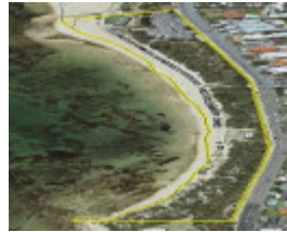
H2369 the brighton bathing boxes and dendy street beach air photo 21-11-2017.JPG