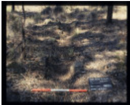
WATER CHANNEL (FEATURE 36) BENDIGO MINING NL