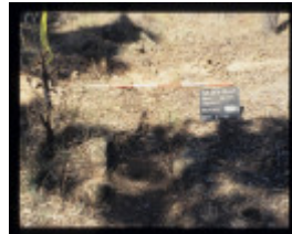
WATER CHANNEL (FEATURE 36) BENDIGO MINING NL