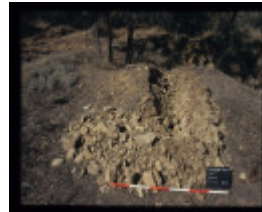
WATER CHANNEL (FEATURE 36) BENDIGO MINING NL