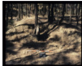
WATER CHANNEL (FEATURE 36) BENDIGO MINING NL