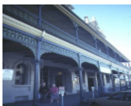
shamrock hotel bendigo front verandah jul1984