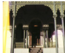
shamrock hotel bendigo entrance nov1989