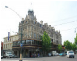
SHAMROCK HOTEL SOHE 2008