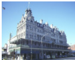
1 shamrock hotel bendigo front elevation jul1984