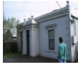
Emoh Cox Street Portv Fairy Front View