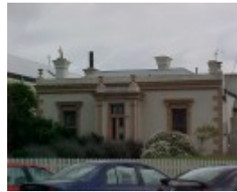
1 emoh cox street port fairy entrance nov1999