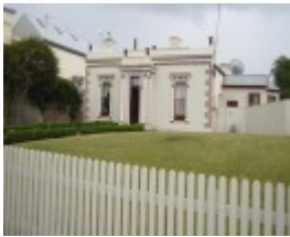
EMOH SOHE 2008