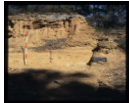
CULVERT (FEATURE 45.1) SHAFT (FEATURE 45.2) AND DAM (FEATURE 45.3) BENDIGO MINING NL EXCAVATION