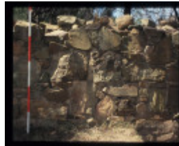
CULVERT (FEATURE 45.1) SHAFT (FEATURE 45.2) AND DAM (FEATURE 45.3) BENDIGO MINING NL EXCAVATION