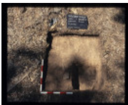
CULVERT (FEATURE 45.1) SHAFT (FEATURE 45.2) AND DAM (FEATURE 45.3) BENDIGO MINING NL EXCAVATION