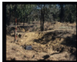
CULVERT (FEATURE 45.1) SHAFT (FEATURE 45.2) AND DAM (FEATURE 45.3) BENDIGO MINING NL EXCAVATION