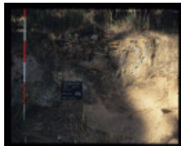
DAM WALL AND ASSOCIATED FEATURES BENDIGO MINING NL FEATURE 47 EXCAVATION