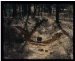
DAM WALL AND ASSOCIATED FEATURES BENDIGO MINING NL FEATURE 47 EXCAVATION