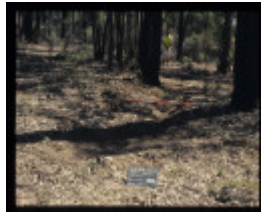
DAM WALL AND ASSOCIATED FEATURES BENDIGO MINING NL FEATURE 47 EXCAVATION