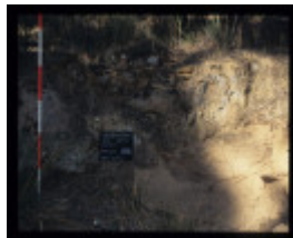
DAM WALL AND ASSOCIATED FEATURES BENDIGO MINING NL FEATURE 47 EXCAVATION