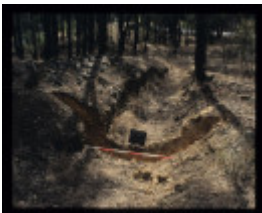
DAM WALL AND ASSOCIATED FEATURES BENDIGO MINING NL FEATURE 47 EXCAVATION