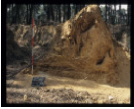
DAM WALL AND ASSOCIATED FEATURES BENDIGO MINING NL FEATURE 47 EXCAVATION