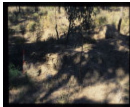
DAM WALL AND ASSOCIATED FEATURES BENDIGO MINING NL FEATURE 47 EXCAVATION