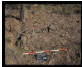
DAM WALL AND ASSOCIATED FEATURES BENDIGO MINING NL FEATURE 47 EXCAVATION