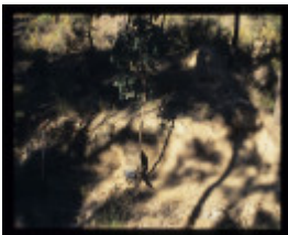
DAM WALL AND ASSOCIATED FEATURES BENDIGO MINING NL FEATURE 47 EXCAVATION