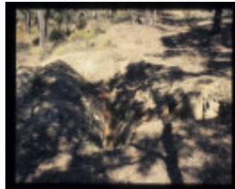
DAM WALL AND ASSOCIATED FEATURES BENDIGO MINING NL FEATURE 47 EXCAVATION