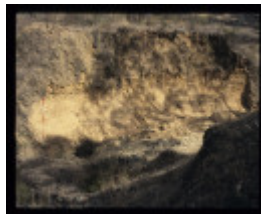
DAM WALL AND ASSOCIATED FEATURES BENDIGO MINING NL FEATURE 47 EXCAVATION