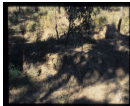
DAM WALL AND ASSOCIATED FEATURES BENDIGO MINING NL FEATURE 47 EXCAVATION