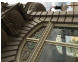
BULL & MOUTH HOTEL October 2016