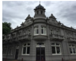
BULL & MOUTH HOTEL October 2016