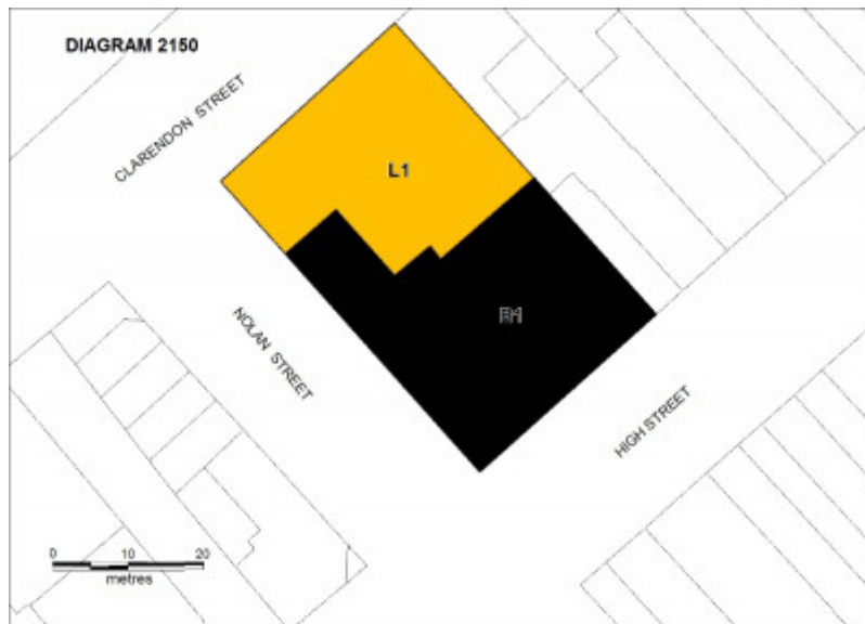
Bull & Mouth_Maryborough_plan