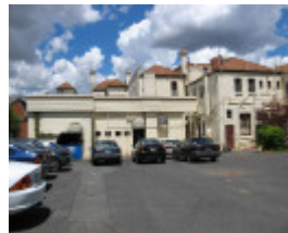
Bull & Mouth_Maryborough_rear view_KJ_8 Nov 07