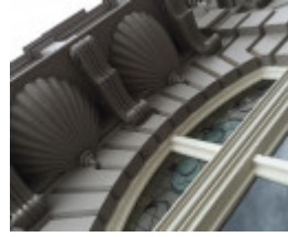
BULL & MOUTH HOTEL October 2016