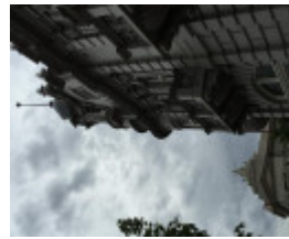
BULL & MOUTH HOTEL October 2016