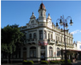
Bull & Mouth_Maryborough_KJ_8 Nov 07