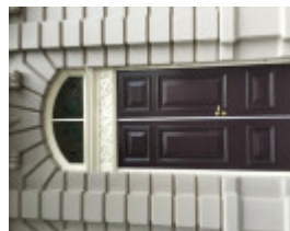
BULL & MOUTH HOTEL October 2016