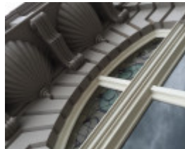
BULL & MOUTH HOTEL October 2016