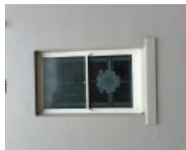
BULL & MOUTH HOTEL October 2016