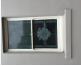
BULL & MOUTH HOTEL October 2016