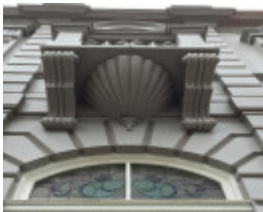
BULL & MOUTH HOTEL October 2016