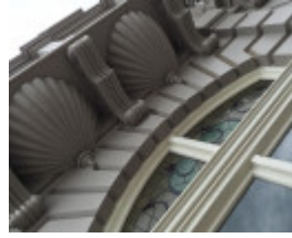
BULL & MOUTH HOTEL October 2016