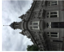
BULL & MOUTH HOTEL October 2016