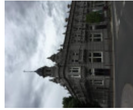
BULL & MOUTH HOTEL October 2016