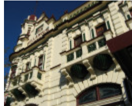
Bull & Mouth_Maryborough_KJ_8 Nov 07