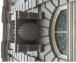
BULL & MOUTH HOTEL October 2016