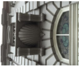
BULL & MOUTH HOTEL October 2016