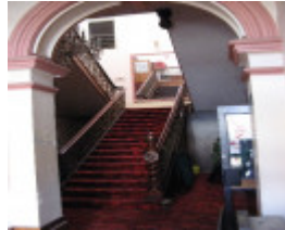
Bull & Mouth_Maryborough_staircase Nov 07