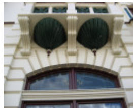
Bull & Mouth_Maryborough_exterior detail_KJ_8 Nov 07