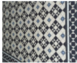
BULL & MOUTH HOTEL October 2016