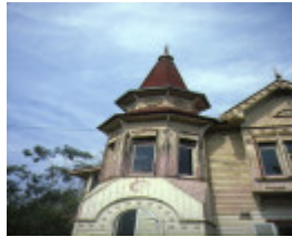
1 the eyrie reginald street quarry hill bendigo turret view feb1983