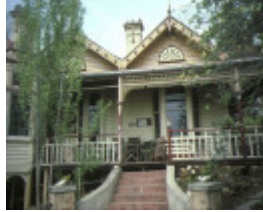
the eyrie reginald street quarry hill bendigo front view feb1983