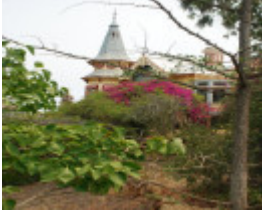
THE EYRIE SOHE 2008