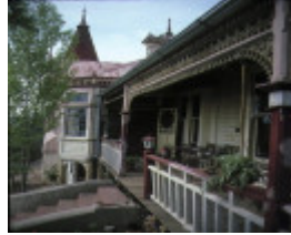
the eyrie reginald street quarry hill bendigo verandah feb1983