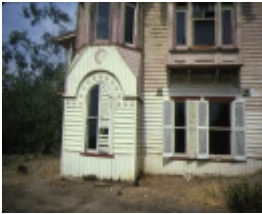
the eyrie reginald street quarry hill bendigo ground floor detail feb1983