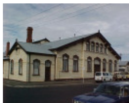
H01949 ranger barracks ballarat rear pm1 jan00