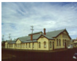
H01949 ranger barracks ballarat rear pm1 feb00 3