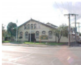
1 ranger barracks ballarat curtis st elevation