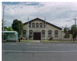
H01949 ranger barracks ballarat pm1 jan00 2