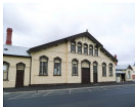
RANGER BARRACKS SOHE 2008