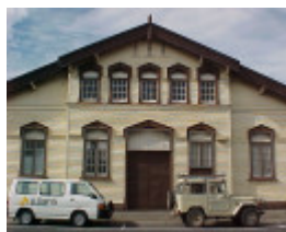
H01949 ranger barracks ballarat rear pm1 jan00 2