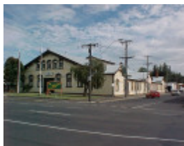
H01949 ranger barracks ballarat pm1 jan00 1