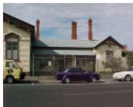
H01949 ranger barracks ballarat quarters pm1 jan00