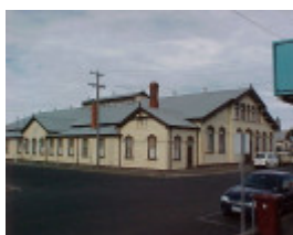
H01949 ranger barracks ballarat rear pm1 jan00 3