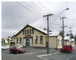
RANGER BARRACKS SOHE 2008