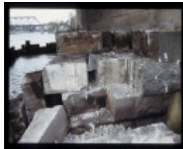
SHEPHERD SWINGBRIDGE ABUTMENT FOUNDATIONS EXCAVATION