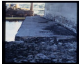
SHEPHERD SWINGBRIDGE ABUTMENT FOUNDATIONS EXCAVATION