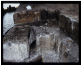
SHEPHERD SWINGBRIDGE ABUTMENT FOUNDATIONS EXCAVATION