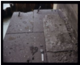
SHEPHERD SWINGBRIDGE ABUTMENT FOUNDATIONS EXCAVATION