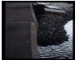
SHEPHERD SWINGBRIDGE ABUTMENT FOUNDATIONS EXCAVATION