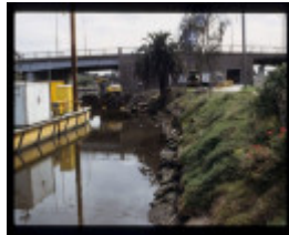
SHEPHERD SWINGBRIDGE ABUTMENT FOUNDATIONS EXCAVATION