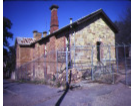
1 old police barracks bendigo side view aug1982