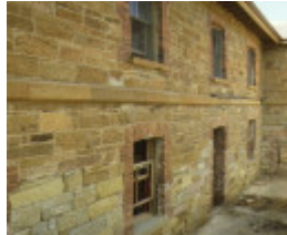
old police barracks bendigo side wall & courtyard may1993