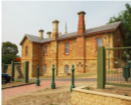
OLD POLICE BARRACKS SOHE 2008