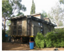
h00072 h00072 preshil school may 05 tree house