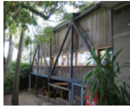
h00072 h00072 preshil school may 05 prep room rear