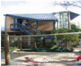
h00072 h00072 preshil school may 05 library