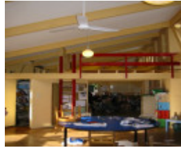
h00072 h00072 preshil school may 05 home rooms