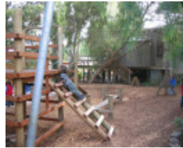
h00072 h00072 preshil school may 05 grounds