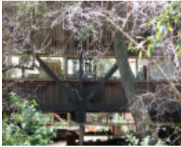
PRESHIL JUNIOR SCHOOL SOHE 2008