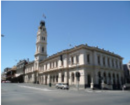
BALLARAT POST OFFICE SOHE 2008