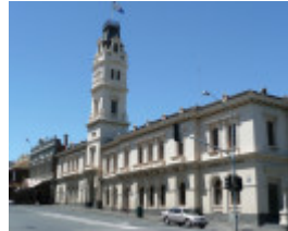
BALLARAT POST OFFICE SOHE 2008