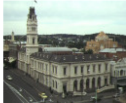
1 ballarat post office aerial view 1992