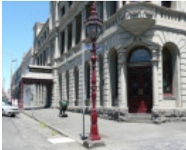
GAS LAMPS SOHE 2008