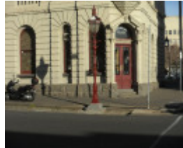
B1 - Reconstructed lamp set back 1m from street corner