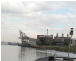
Commonwealth Fertilisers Wharves Maribyrnong July 2003