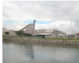
Commonwealth Fertilisers Wharves Maribyrnong July 2003 Commonwealth Fertilisers Factory