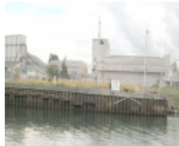
Commonwealth Fertilisers Wharves Maribyrnong July 2003 Iron Sheet Piling 001