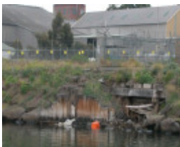
Commonwealth Fertilisers Wharves Maribyrnong July 2003 Iron Sheet Piling 002