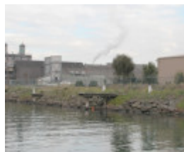
Commonwealth Fertilisers Wharves Maribyrnong July 2003 Wharf And Bollards